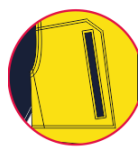
ERGONOMIC POCKETS WITH ZIPPERED CLOSURES

» WIDE SELECTION. This garment is part of a wide collection of garments with the same line of design and qualities that offer a global solution.