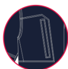
ERGONOMIC POCKETS WITH ZIPPERED CLOSURES