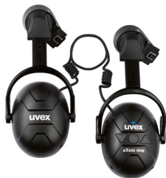
Picture of mounted cup arms for uvex bayonet version