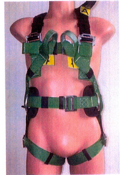
Full body harness, type HS-51/T