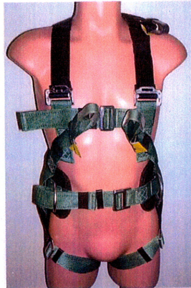
Full body harness, type HS-51