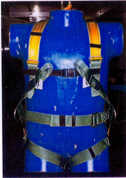
Full body harness, type HS-50